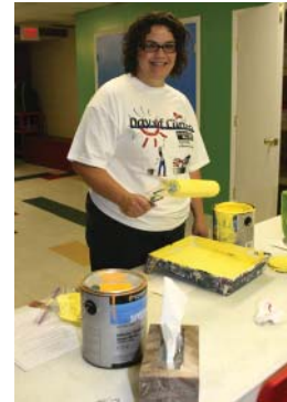
Painting, including this work at the Discovery Center, is a popular Day of Caring activity.