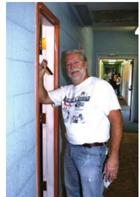
Painting a door frame at the Children's Home is a helpful Day of Caring work project.