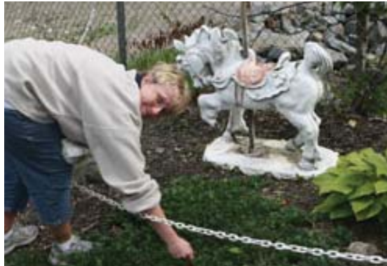
A volunteer works on the grounds of the Binghamton Zoo at Ross Park during Day of Caring.

In addition, four organizations that were unable to release their employees to be volunteers on Day of Caring organized drives instead, collecting items such as food, paper products, clothing items, or school supplies which were then donated to appropriate local agencies or organizations.