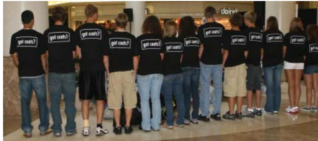
Vestal High School's boys' and girls' soccer teams advertised the coat drive with "got coats?" on their shirts.