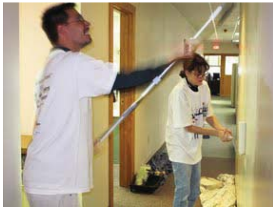
Volunteers from the Communications Association of the Southern Tier paint hallways at United Way.