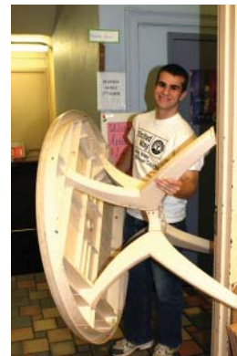
A volunteer moves furniture at the Binghamton Boys and Girls Club during Day of Caring.