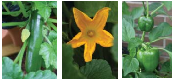
A variety of vegetables were grown by GROW BROOME.