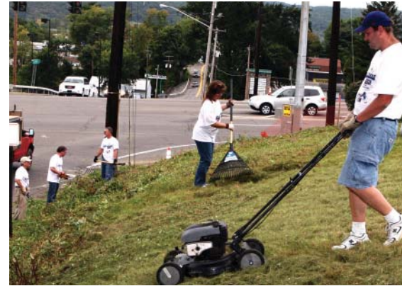
Day of Caring volunteers do yard work at United Way.