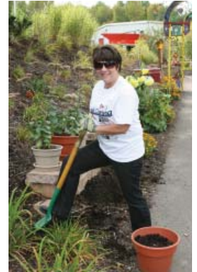
Planting in the Storybook Garden at the Discovery Center on Day of Caring.