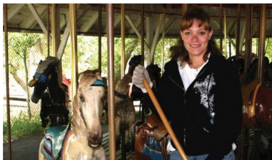
A volunteer cleans the carousel at the Ross Park Zoo.